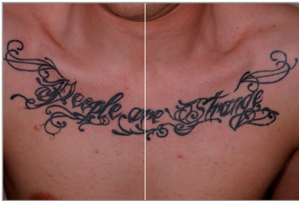
Fig 3. Digital image taken before split treatment. Tattoo 2, with no pretreatment. The left side of the tattoo was treated with the nanosecond laser and the right side with the picosecond laser.