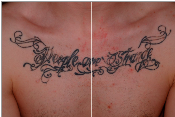
Fig 4. Digital image of tattoo 2, taken 6 weeks following the second and final treatment. The left side of the tattoo was treated with the nanosecond laser and the right side with the picosecond laser.