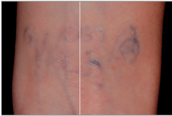
Fig 2. Digital image of tattoo 1, taken 6 weeks following the second and final treatment. The left side of the tattoo was treated with the nanosecond laser and the right side with the picosecond laser.