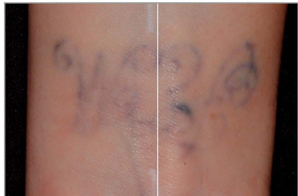
Fig 1. Digital image taken before split treatment. Tattoo 1, previously treated with the nanosecond laser 10 times. The left side of the tattoo was treated with the nanosecond laser and the right side with the picosecond laser.

Twenty-one patients (10 men and 11 women) took part in this study; they had a mean age of 33.2 \pm 9.3 years (range 20–47) and a total of 30 professionally applied black tattoos (examples in Figs 1–4). The average size of the tattoo was 37.8 \pm 47.6 cm 2 (range 2.25–160.0). On average, the tattoos had been present for 7.6 \pm 6.6 years (range 1–20). Fourteen of the 30 tattoos were located on the upper extremities, six on the torso and five each on the head and lower extremities. A mean 4.7 \pm 4.1 sessions (range 0–16) were held before the beginning of the trial (exclusively with the NSL MedLite®C6 as single-pass treatments), with clearance of 3 quartiles (median).